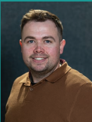
BEN Operations Manager