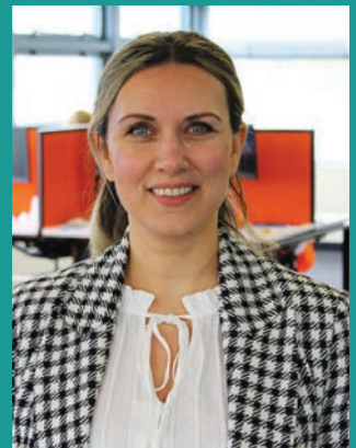
SIGITA Site Technical Manager